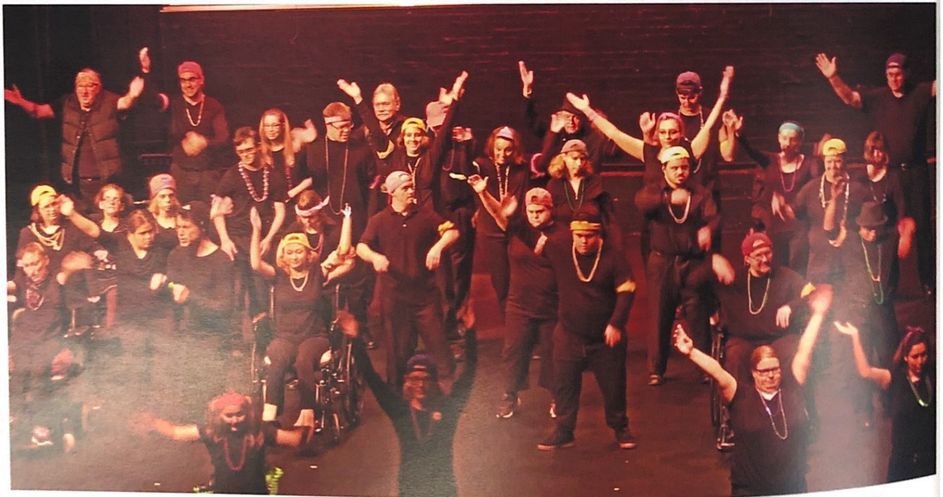
The cast of " disAbility—The Evolution " perform a Hamilton-esque version of "Our Shot" at the Waukesha Civic Theatre.

Sixteen ACAP members were in the show of a total of 39 cast members. Attendance at the show surpassed 600. The show was enthusiastically received and is scheduled to go on the road to the 11th Annual Self Determination Conference in the Wisconsin Dells later this month.