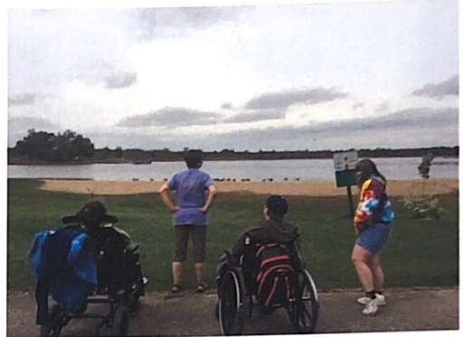
The women of ACAP trekking to the beach from the accessible cabin

"Any way we can upgrade this [state parks] to make it more accessible is always a good thing," says Assistant Superintendent of the Kettle Moraine Southern Unit, Brian Lemke. Members of the ACAP Ink team were able to ask a few questions of Lemke in regards to the accessibility of the cabin that the ACAP Men and Women of the Woods utilize. The accessible cabin used by ACAP, (one of nearly ten in the Wisconsin Park System), is located in the Kettle Moraine State Forest—Southern Unit. According to Lemke, the accessible cabin is utilized nearly every night from May to October, which is when the cabin is operational. Besides the accessible cabin, Ottawa Lake also houses a few accessible campground sites, complete with level areas for easier access. These accessible sites are located near accessible restrooms. Campers are not asked of their specific disability when registering for the campsites. Lemke said these options are important as, "they provide a service that otherwise wouldn't allow individuals with disabilities to experience the park."