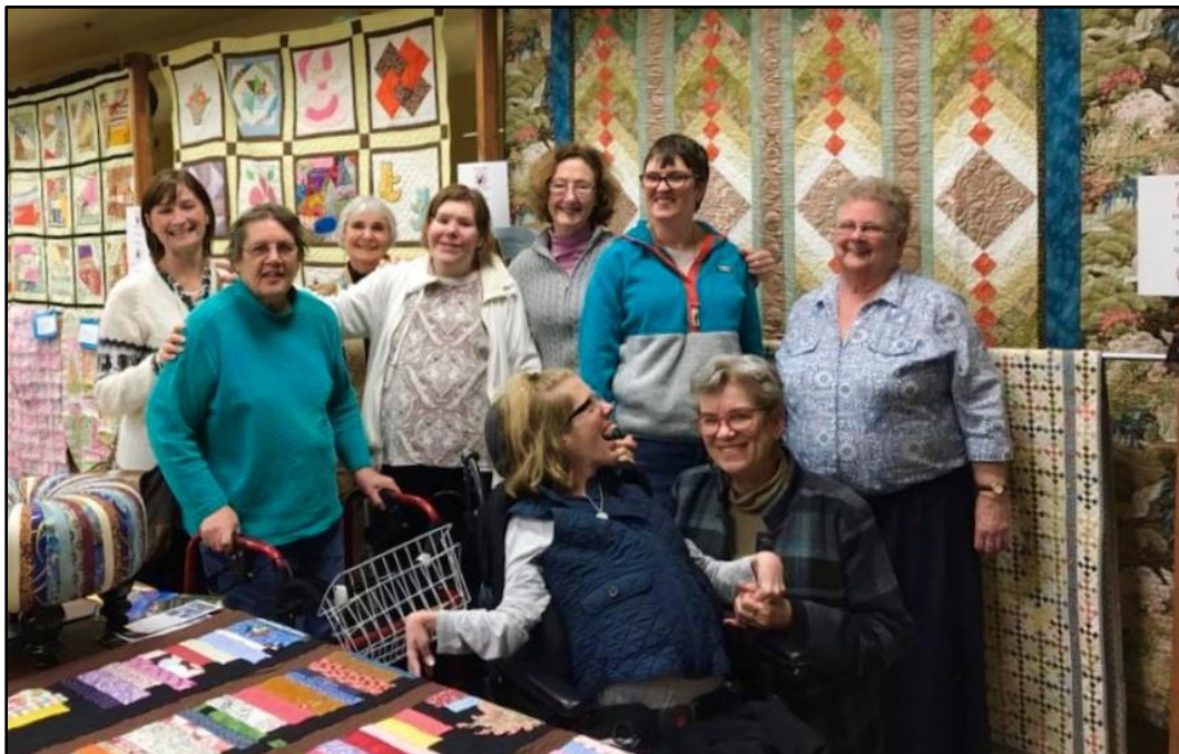
Our Thread Heads class visit a local quilting show to see the beauty of practical art.