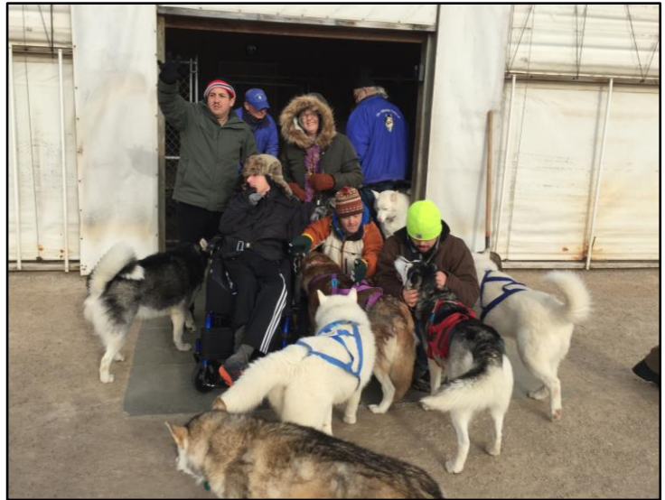
ACAP members enjoyed dogsledding at Monroe, WI, a new activity for us at ACAP.